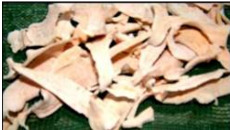
Figure 2. Rural open-air sun drying of medium to large sized sweetpotato to amukeke

Sliced samples open-air sun dried for ~18 hours (2 day period) at 31.4-50°C; Relative humidity 18.7-46% with occasional turning to improve the drying.