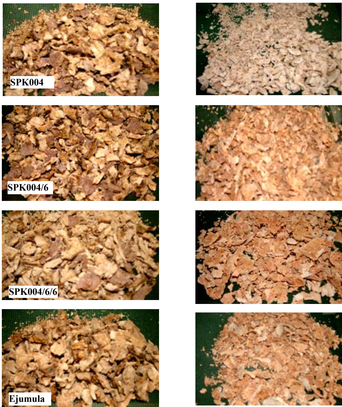
Figure 3. (a) Inginyo products following the indigenous open-air sun drying method (b) Inginyo products from a slightly modified method to reduce the darkening appearance

Open-air sun drying of sweetpotato is prevalent in Sub Saharan region. Inginyo and Amukeke constitute main dried sweetpotato products in Eastern region of Uganda. Figure 3 shows inginyo products dried from the four OFSP varieties. Figure 3 a shows produced according to the indigenous method of Eastern Uganda and figure (b) using slightly modified method to reduce the darkening appearance.