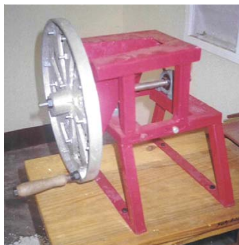
Figure 6: Table mounted manual chipper with pillow block bearings.