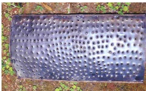
Figure 5: The traditional cassava-rasping sheet.

modified manual chippers but with increased hopper size (39 cm x 35 cm) and a welded metal stand, making the overall height of the machine 95 cm. Another modification was a re-design of the engine-powered chipper to make it dual purpose so that it could be operated with a 3.5-5.5 HP engine or without