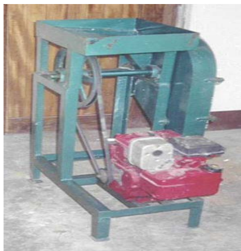
Figure 3: Engine powered chipper.

Engine powered grater (Figure 4). This was also of the IITA design manufactured in collaboration with Reliable Motor works in Dar es Salaam. The main features were a two-side concave hopper with 30 cm x 30 cm feed opening, a horizontally mounted rasped drum