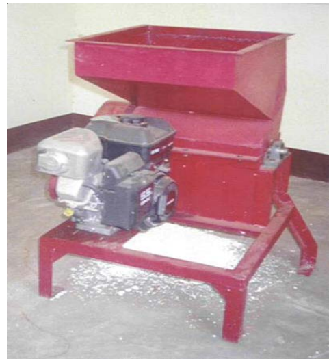
Figure 10: Engine powered grater.

Equipment testing. Due to the high cost of making a working table for fixing cassava slicing/chipping machine, the manual chipper/slicer that was meant to be operated while fixed on a table was operated while held firmly on the ground (Figure 1), parallel with the same design that was improvised with wooden legs (Figure 2). At both the inception and the modification stages chipping and grating machines were tested by 40 participating farmers about half of them women, in collaboration with researchers and extension agents in Kibaha and Muheza districts and researchers at Sokoine University of Agriculture. The experiments were done on local cassava varieties and prior to chipping and grating the roots were peeled