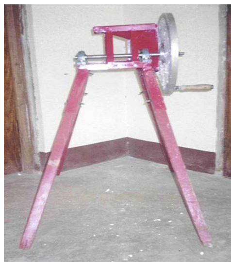
Figure 7: Wooden legged manual chipper with pillow block bearings.