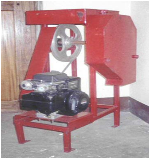
Figure 9: Engine-powered pedestal-type chipper.

the need to imitate the pedestal-type chipper and provision of belt safety cover (Figure 9).