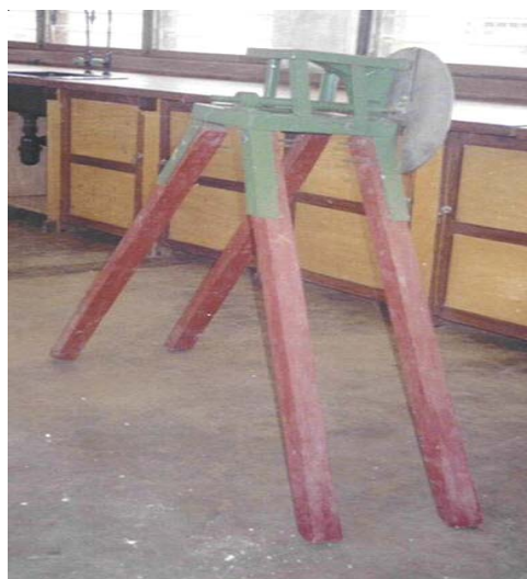
Figure 2: Manually operated slicing machine with wooden legs.

with Reliable Motor Works workshop in Dar es Salaam. The main functioning features of the manual chippers/slicers were the frame, the chipping/slicing disc, and a small feed hopper with a feed chute that progressively increases from 4 to 10 cm and two-stage feeding angles, the first one at about 30° and the second one at about 60° from the horizontal plane to the chipping/slicing disc. The chipping/slicing disc was mounted vertically with disc shaft running through sleeve bearings. The chipping disc featured eight symmetrical clusters of 5 mm diameter holes, each cluster bearing 14 holes in double rows running in convex mode from the centre to the periphery. Disc support stiffeners separated clusters where the disc was firmly bolted.