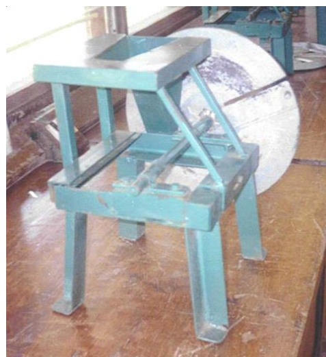
Figure 1: Manually operated slicing machine.

Manual slicers. A manually operated slicing machine (Figure 1) of the IITA design equipped with a two-blade slicing disc was obtained from Uganda. This was made to be fixed on a table but due to seemingly added costs of fixing it permanently on a table and thereby rendering it immovable, a decision was made to manufacture a similar one (Figure 2) locally with provision for fixing on four light wooden stands. This would allow personnel to work while standing and quick manoeuvre. For each of the machine, chipping disc for interchangeability of slicing and chipping activities was also manufactured. The manufacturing work was done in collaboration