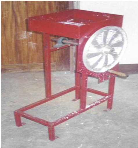
Figure 8: Pedestal-type chipper.