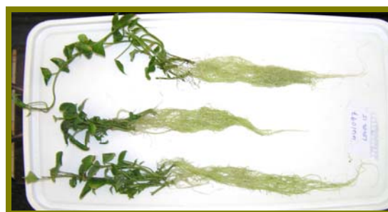
Figure 4. Tolerant genotype 441097 ( 0,5,15 g/lit of PEG)