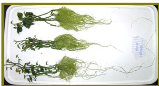
Figure 3. Tolerant genotype 440378- ( 0,5,15 g/lit of PEG)

Under control treatment genotypes 189135.9, 441538 and 441768 registered higher root weight that ranged from 5.23 to 6.0 g. These were significantly different from that of the check (1.27g) table 2. There was significant root weight reduction as stress increased. Genotypes that exhibited higher root weight at 15 g/l concentration of PEG were 189135.9 (5g), 194569.1 (5.03g), 440429(4.37g) and 441768(5.37g). These were significantly higher than of the check (2.20g). Higher mean root weight across the salt levels was recorded for genotypes 194515.5, 441538, 440378 (figure 3), 441097 (Figure 4) and 441768 and this ranged from 3.05 g to 5.62 g